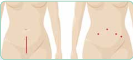
Open Surgery Incision

Laparoscopic sacrocolpopexy is a minimally invasive alternative to open surgery. This approach is considered to be technically challenging due to the extensive suturing and dissection required, along with the limitations of traditional laparoscopic technology.